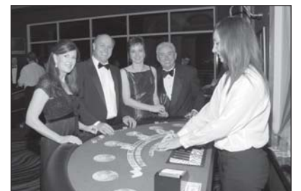
Guests tried their luck in the Club Casino Royale