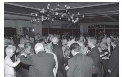
Everyone enjoyed the sounds of the Power House Group